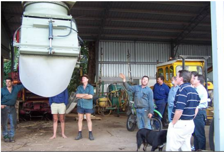
Figure 2. Talking generally about the harvester