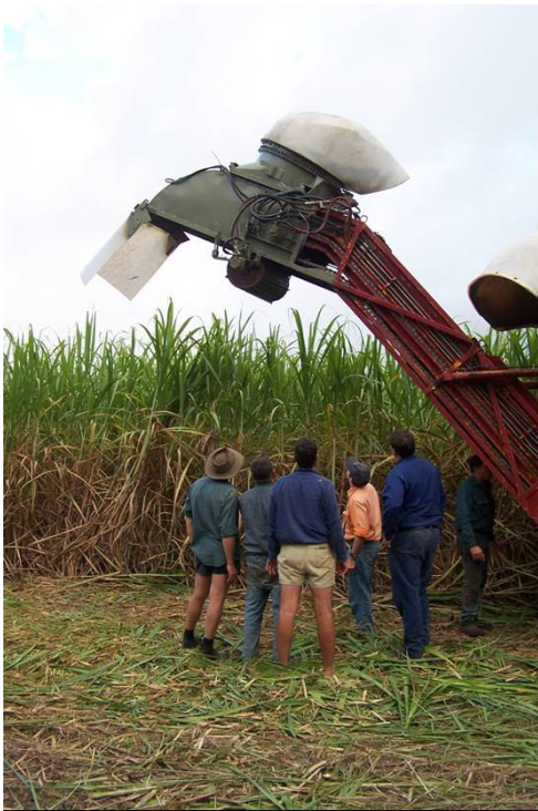
Figure 4. Discussing issues

With regard to the communication aspect of the workshop, growers were asked to complete a short questionnaire that was emailed to them before the workshop. Three did this and the results were that overall that these three felt that they were fairly confident about being able to deal with speaking publicly.