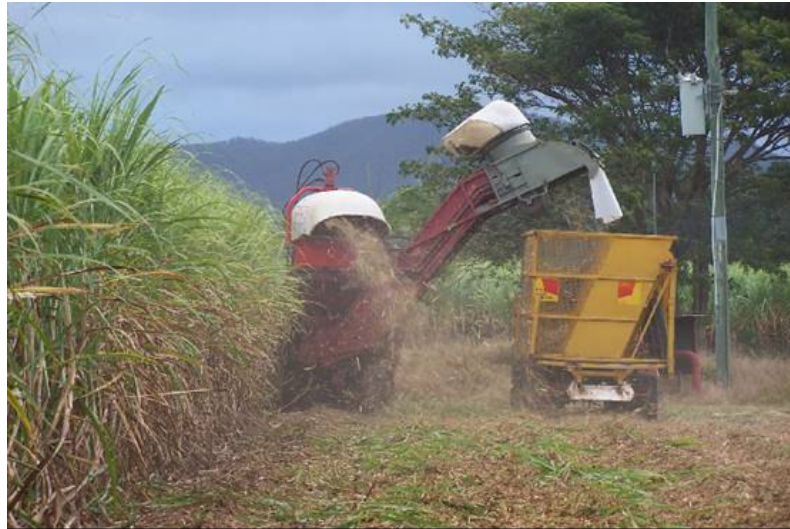
Figure 3. Seeing the harvester in action