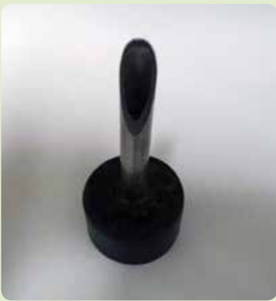
Above: Cane Sap Extraction Tool (Dibbler).

The chart below shows Michael's refractometer readings over time of five varieties. The results indicate a general increase in sugar content of all varieties. Harvesting Q200 ® early and Q208 ® later maximised the whole-farm sugar yield in this season.