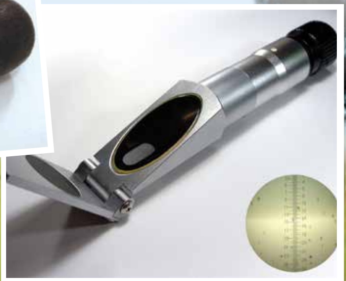
Top left: Dibbler. Top right: Refractometer.