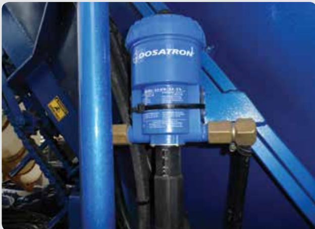
Above: Dosatron® Model D25RE2 fitted to Graeme Blackburn's billet planter.

As a contractor, Dave likes the system because growers supply their own container of insecticide and take back what is unused. It also increases safety in the field as there is no manual mixing of concentrate.