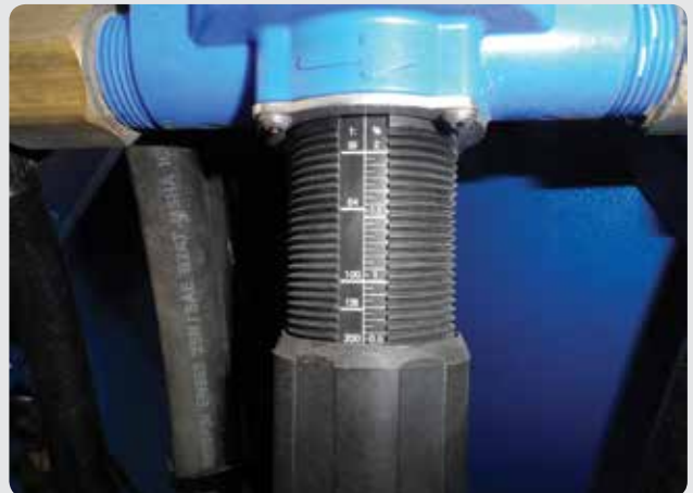
Above: Close-up of the simple adjustment to set the required mix concentration.