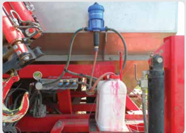
Above: Close-up showing how the Dosatron® draws insecticide concentrate straight from original container.