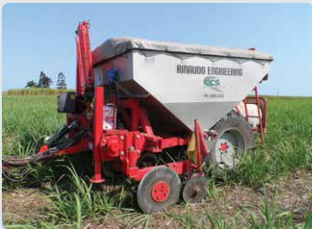
Above: Central Coast Spreading's fertiliser/Confidor applicator, fitted with a Dosatron® Model D25RE2.