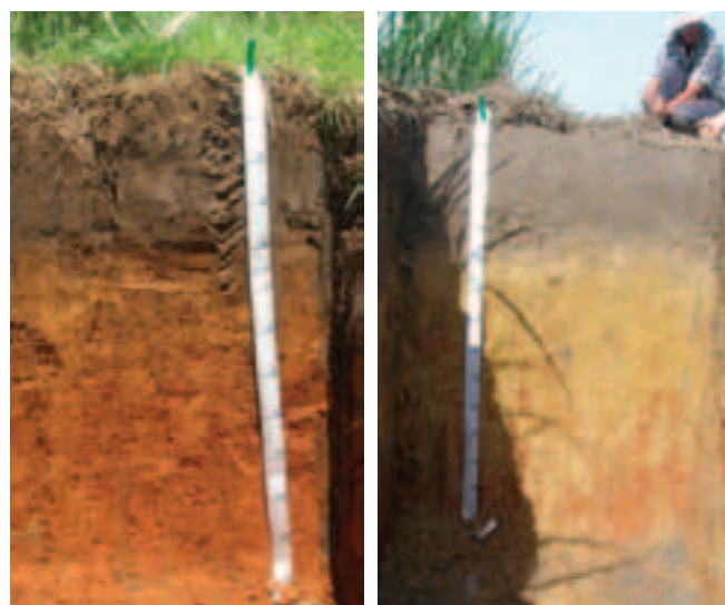
FIGURE 3 | Two broad soil types, red clay loam and yellow clay loam, were identified within the 22 ha Bundaberg study site.

Substantial progress has been made with the above mentioned activities at the three study sites (Table 1), with the most comprehensive assessment being undertaken at the Bundaberg site over the two past seasons.