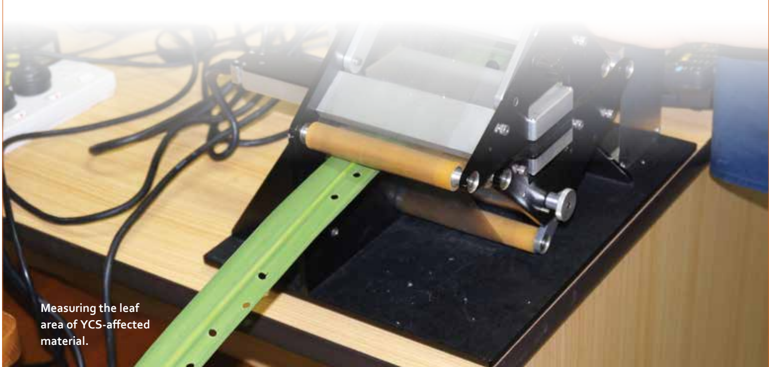
Measuring the leaf area of YCS-affected material.