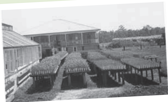
Above: Meringa glasshouses years ago.