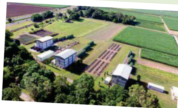
Above: Meringa photoperiod facilities today.

Far North Queensland has celebrated a century of sugarcane research and development activity at Meringa, south of Cairns.