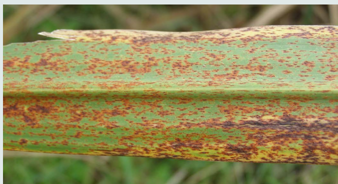
A close-up of a diseased leaf showing the lesions of orange rust.