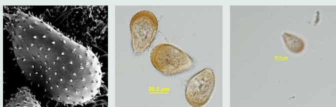
Figure 1: Orange rust spores. Optimum temperature for orange rust spore germination is 17-23°C.