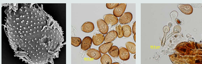
Figure 2: Brown rust spores. Optimum temperature for brown rust spore germination is 11-27°C.