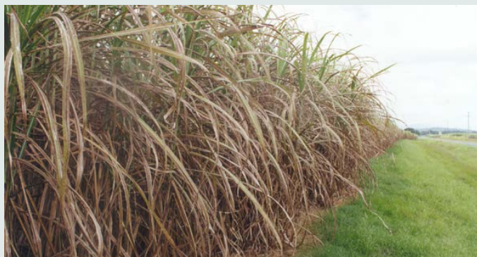
A diseased crop of Q124 – dead leaves on standing cane caused by orange rust.