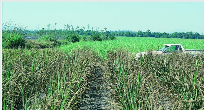
Brown rust in a field of young Q117 plant cane.