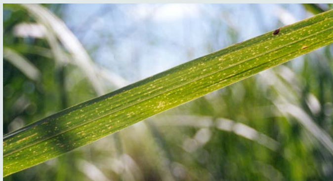
In brown rust the initial yellow spots on leaves increase in size and turn a rusty brown.