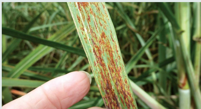
Diseased leaf with orange rust lesions.