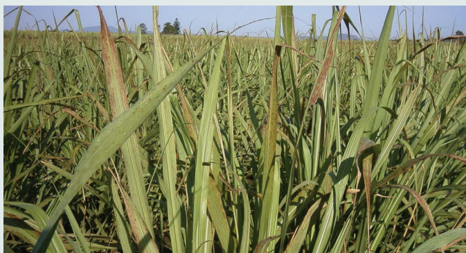
Above: Image 2: Brown rust in Q190 ® . Pustules are more towards the tip.