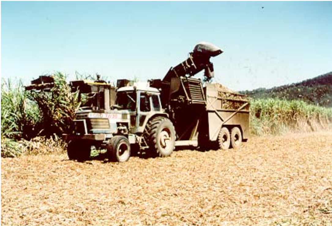
Figure 1: Large haulout equipment used in the sugar industry. What is the cost due to soil compaction?

The economic cost of soil compaction in the Australian sugar industry is unknown. Since the complete adoption of mechanical harvesting in the mid 1970s, the industry has experienced a yield plateau. Soil compaction, as a result of increased infield traffic by heavier equipment, may be a contributing factor (Figure 1). The industry is inexorably moving to bigger and heavier harvesting and haulout equipment. To reduce the effect of traffic on soil compaction, wider tyres and an increasing number of axles are used.